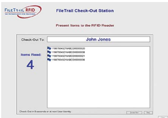
Figure 2: The Check-Out Station automates check-out by reading all the files you are carrying once your security badge has been read.