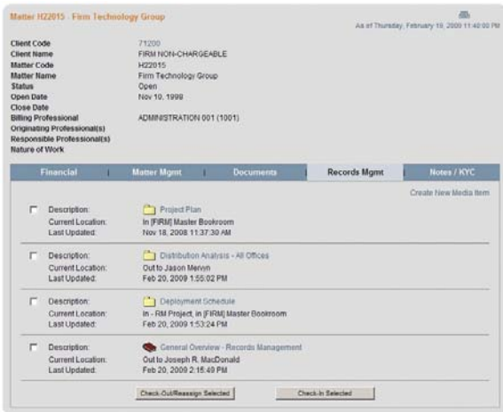
Figure 1: Physical records data from FileTrail appear in the REX Online screen. From this screen, users may also request delivery, view details, or view the location history.

that provide delivery services, users may place requests for retrieval. Prior to this, no information on physical records was available at the desktop, and retrieval required walking to the file room.