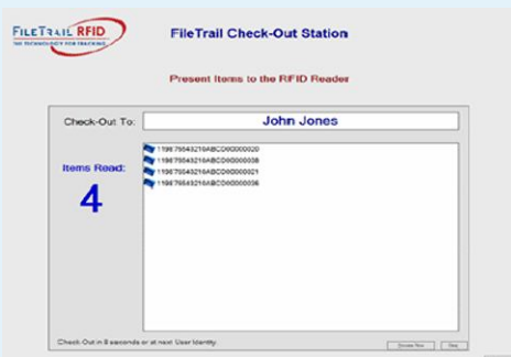
Figure 2 The Check-Out Station automates check-out by reading all the files you are carrying once your Security Badge has been read.