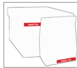
Tag evidence bags and boxes.