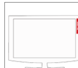
Tag technology and other assets.