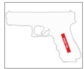
Tag weapons with an embedded tag inside the grip.