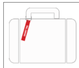
Tag property with hanging tags.