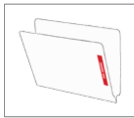
Tag files, documents, etc.